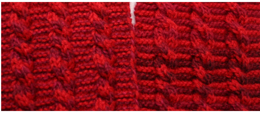
View of wrong side.